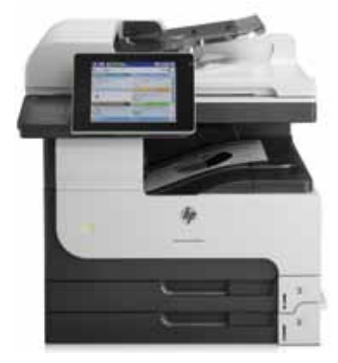
(HP LaserJet Enterprise MFP M725dn shown)

Mobile printing capability: HP ePrint, Apple AirPrint™